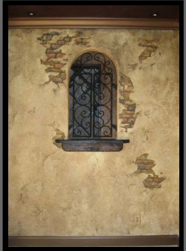
Vintage Wine Cellar