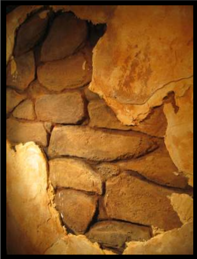
Venetian Stone tool using Ecocrete & oxidizers products