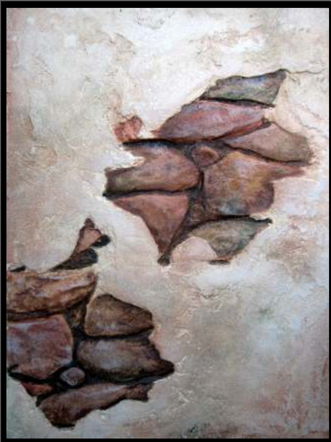
Finished sample in natural light