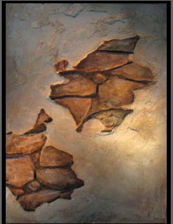
Dimmed spot lighting