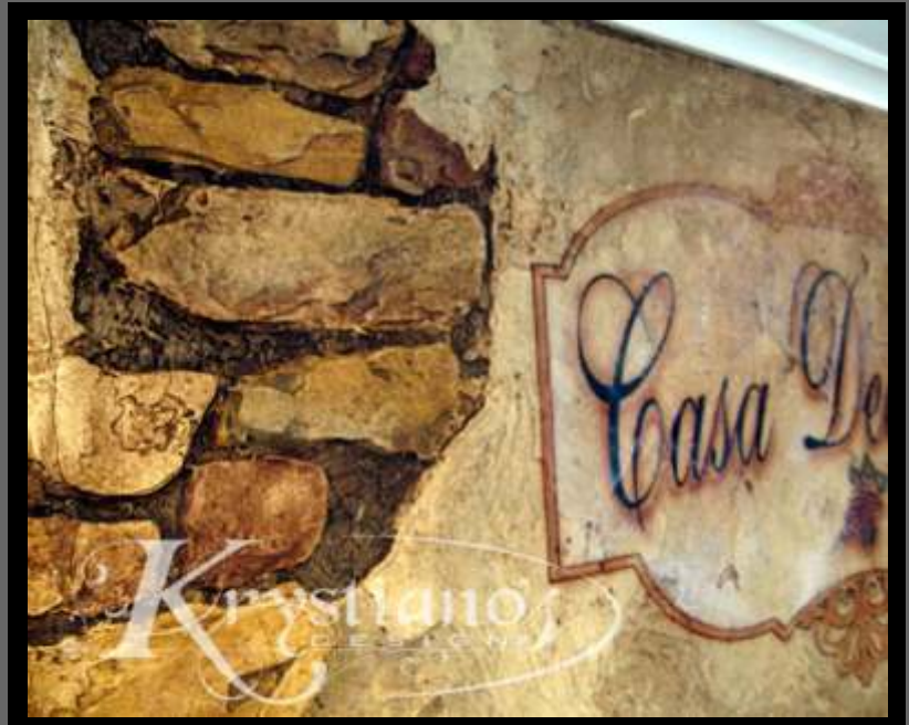
Vintage Wine Cellar & Les Motifs Vintage signs